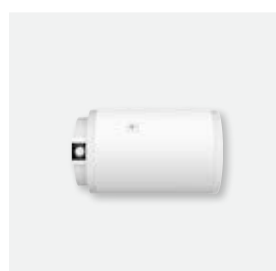
Page 15 PSH WE-H C Heat-up indicator