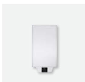
Page 10 PSH Universal EL B-C Function buttons, LCD

■ | ■ Variable, accurate to the degree 7-85 °C