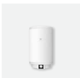
Page 14 PSH Trend C Heat-up indicator