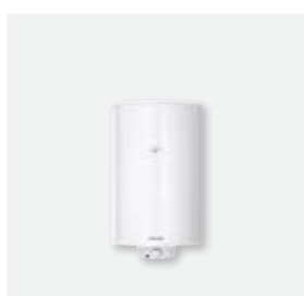
Page 12 PSH Classic C Heat-up indicator