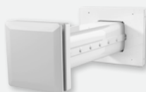
Page 06 VLR 70 S/L